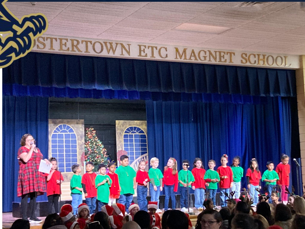
Fostertown Kindergarten Song Swap