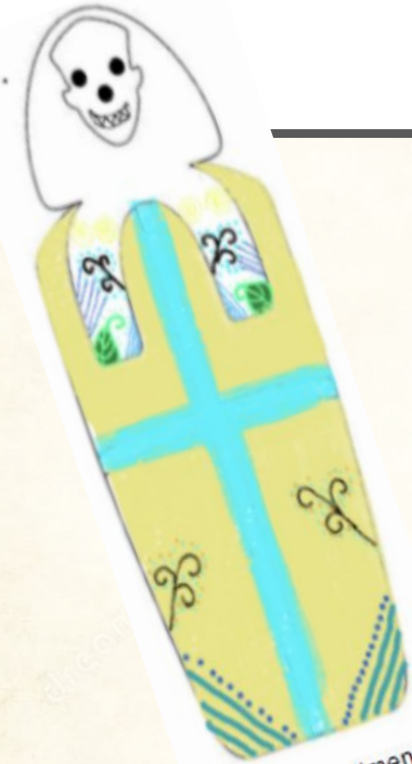
By Princess Jimenez