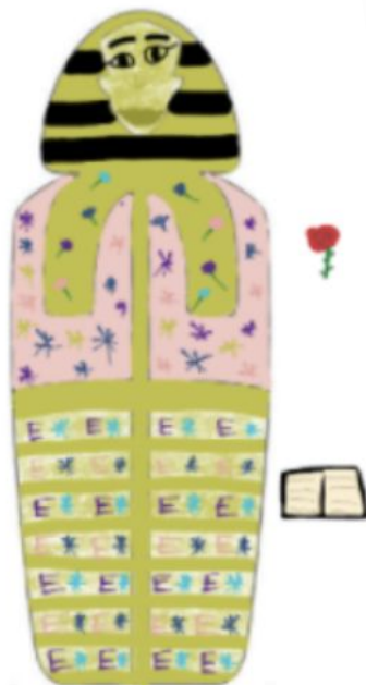
By Evangely Torres