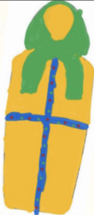
By Ghalaa Aljumaee