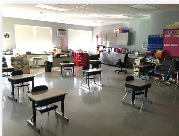
Empty Classrooms – waiting for our kids...

There are more benefit than listed above – but as you can see – there are significant value in practicing daily reading.