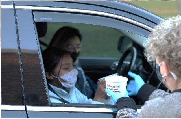
Our Ice Cream Social (Iy Distanced) was a SWEET Success!